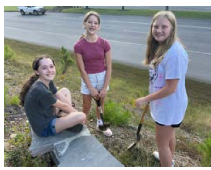
Enhancing the landscaping at St. Margaret's