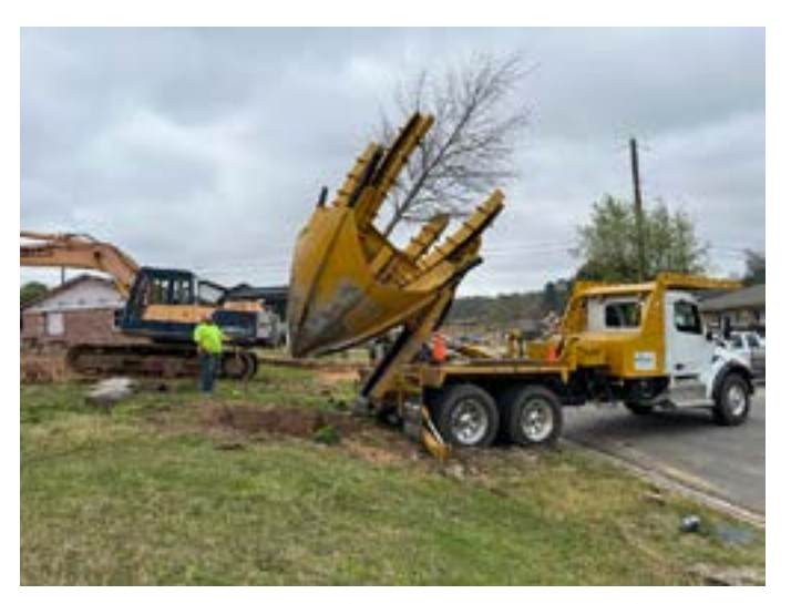
Bemis Tree Farm crew using their massive rig to plant a large tree