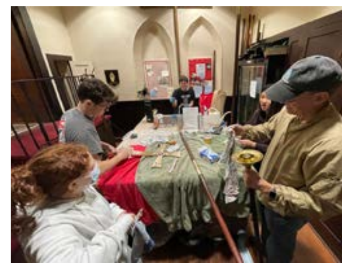
Deep cleaning the sacristy