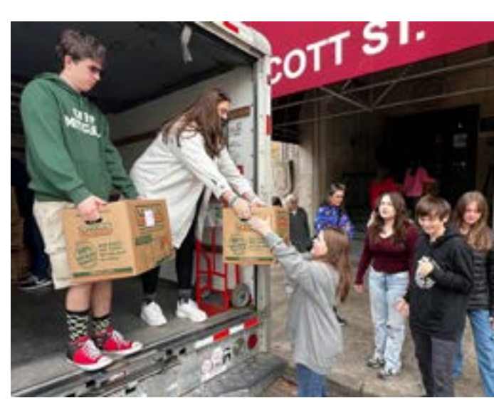
Delivering Christmas gift baskets

EYCollab is finished for the school year, but here are a few highlights from our year together. A consistant theme throughout the semester was service to the community. Here are just few of the projects the youth engaged in.