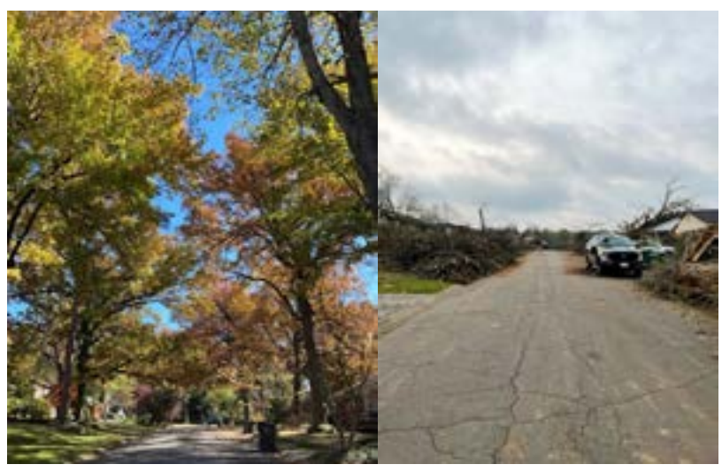
Jewell Road before and after; November 2022, April 2023

March 31, 2023 was a day that changed both the environment and the lives of many in a dramatic fashion. Streets lined with 200 year old trees were stripped of vegetation and homes were severely damaged. Insurance helped with the structure repair but did not address the environmental issues or the psychological and emotional damage.