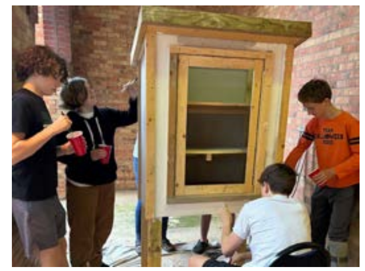
Painting a new "Little Free Pantry" box