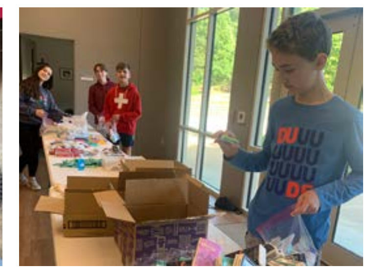
Filling Manna Bags and Hope Sacks