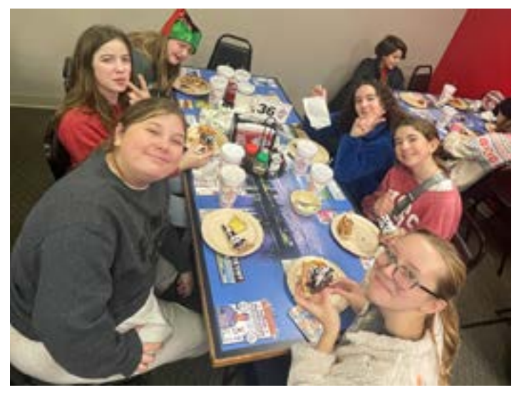
A well deserved pizza lunch.