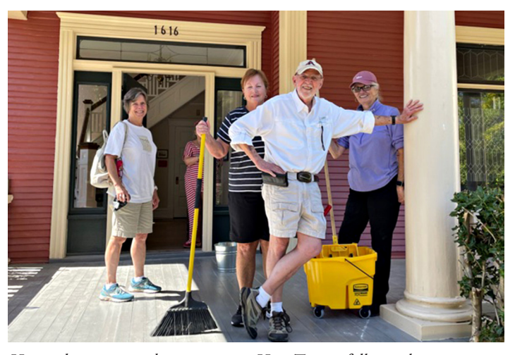
Hospitality starts with preparation. Here Trinity folks work to prepare Harrison House to be a welcoming home for the Afghan family.