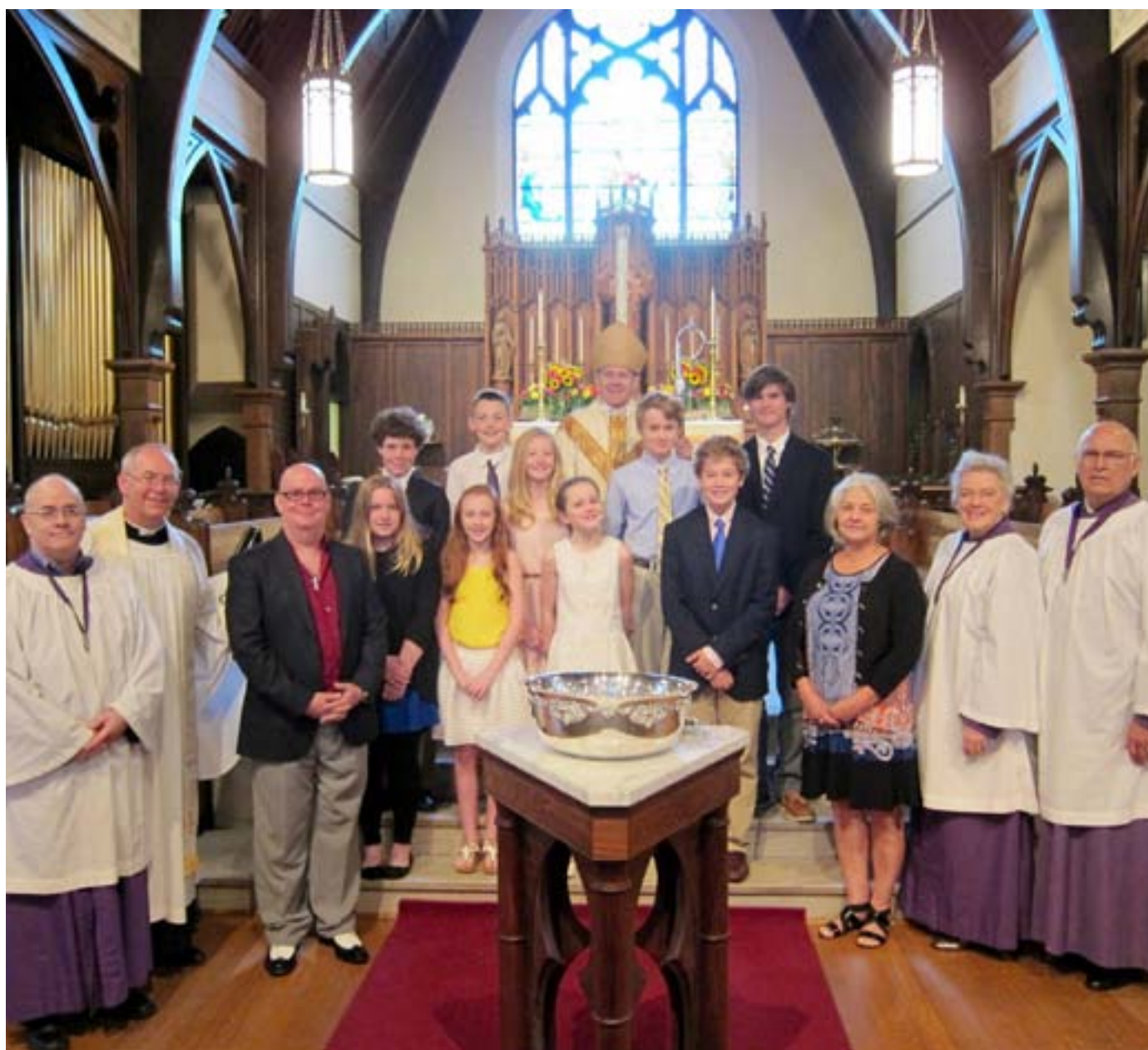
Some of the many people baptized and confirmed at Trinity Cathedral in Little Rock on May 1, 2016

The Newsletter of Trinity Episcopal Cathedral A House of Prayer for All People • June 2016