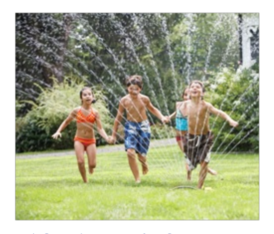
Second Sundays in the Summer presents:

Weekly Worship Schedule: Sunday - 7:30 a.m., 9:00 a.m., 11:15 a.m., & 5:00 p.m. Monday - Friday Morning Prayer at 8:30 a.m. Wednesday Healing Eucharist at 5:15 p.m.