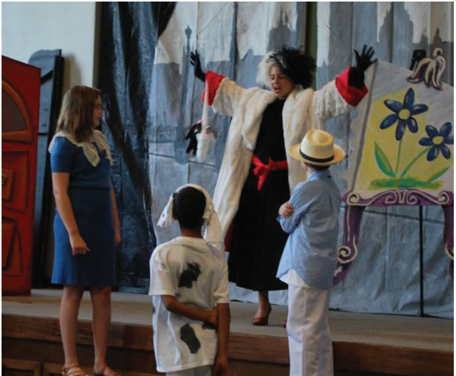
Trinity Episcopal Cathedral's Performance of "Disney's 101 Dalmatians Kids"

The Newsletter of Trinity Episcopal Cathedral A House of Prayer for All People • August 2016