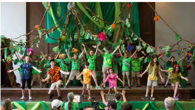
Last year's camp presented The Jungle Book .

Camp will present Pirates of Penzance . This camp is free and open to the public for children who have completed 2 nd grade through high school. Register www.trinitylittlerock.org/events/piratesofpenzance