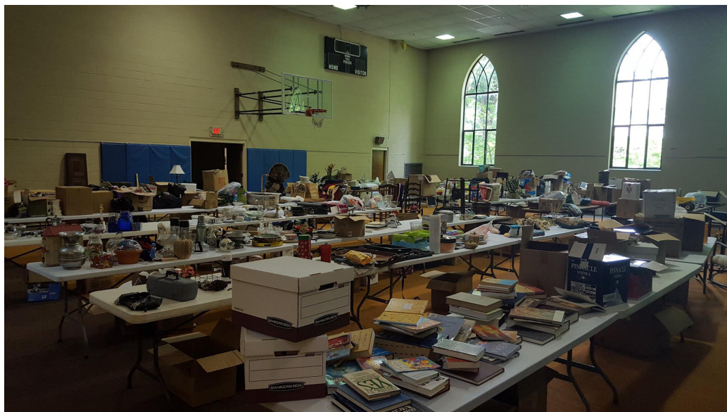
Trinity Treasures 2017