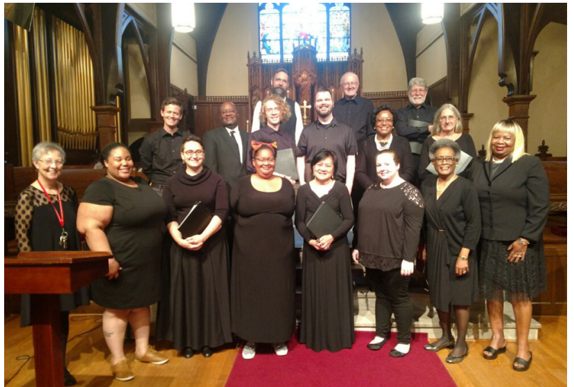
Combined Choirs of Bethel A.M.E. and Trinity Cathedral at the Covenant Renewal Service