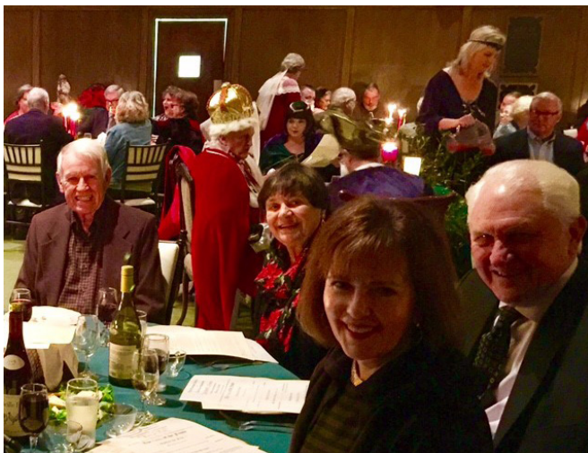
Madrigal Feaste 2016