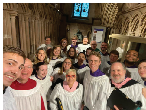
The choir in Lichfield Cathedral