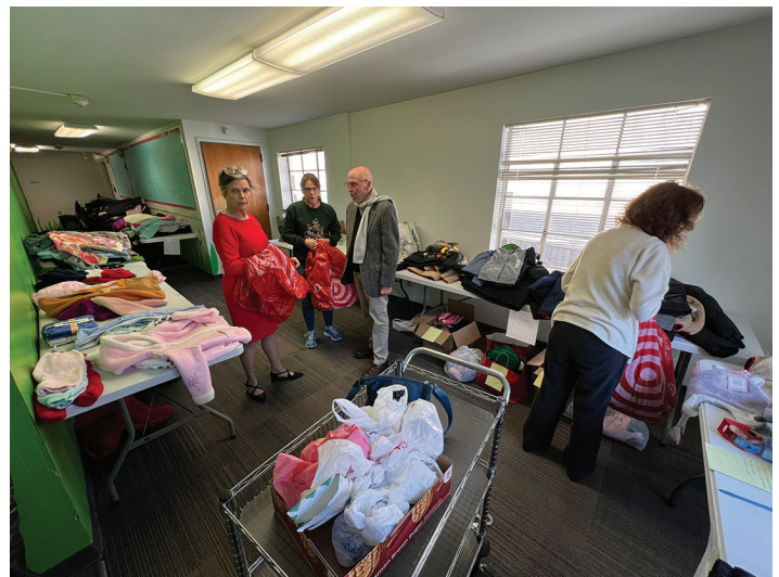
Warm Fuzzy Coat Drive