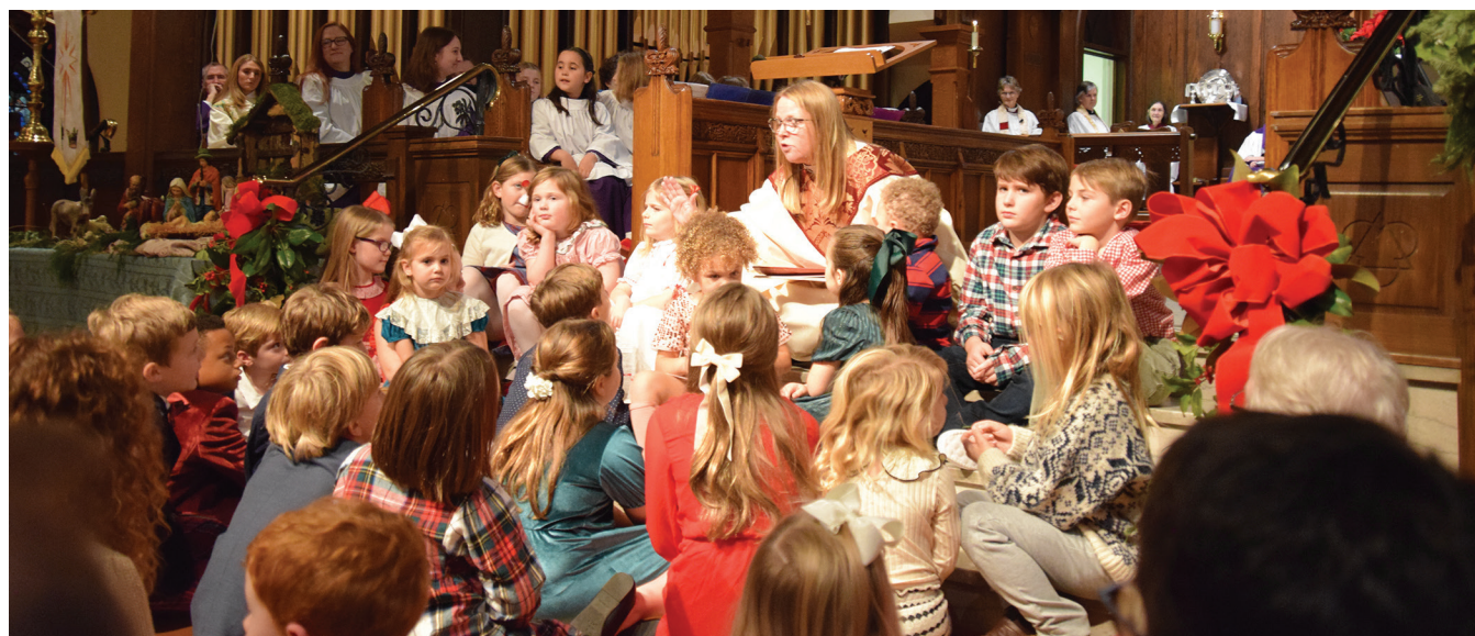
Christmas Eve Family Service