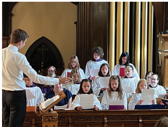
top: Chorister Camp rehearsal bottom: Choristers performing