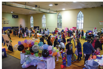
Trunk or Treat