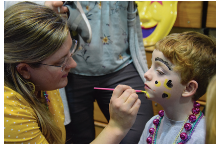
Mardi Gras/Shrove Tuesday