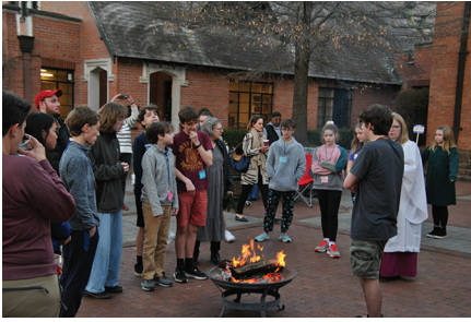
Burning of the Greens