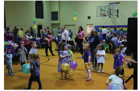
Mardi Gras/Shrove Tuesday