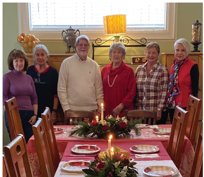
Gaines House Thanksgiving