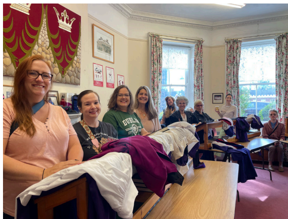
Rehearsing in Lichfield

Technically, our new portative organ did not arrive until the first week of 2024, but it was due to arrive at the end of 2023, so it warrants reporting. This beautiful instrument was made by Taylor and Boody Organ Builders of Staunton, VA, one of the most reputable organ-building firms in the US, and will transform our performances of early music (c. pre-1800). While this may sound like a narrow purpose, the dedication concert on Friday, March 1 at 7 pm will show the breadth of this instrument's usefulness, its beauty, and its practicality. Come have a close look at the organ one of these days;