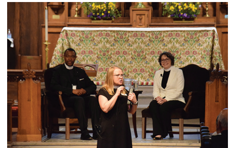
Bishop Candidate Meet and Greet