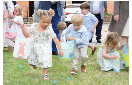
Easter Egg Dash