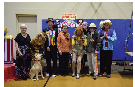
Trunk or Treat