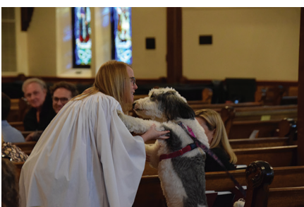
Blessing of the Animals